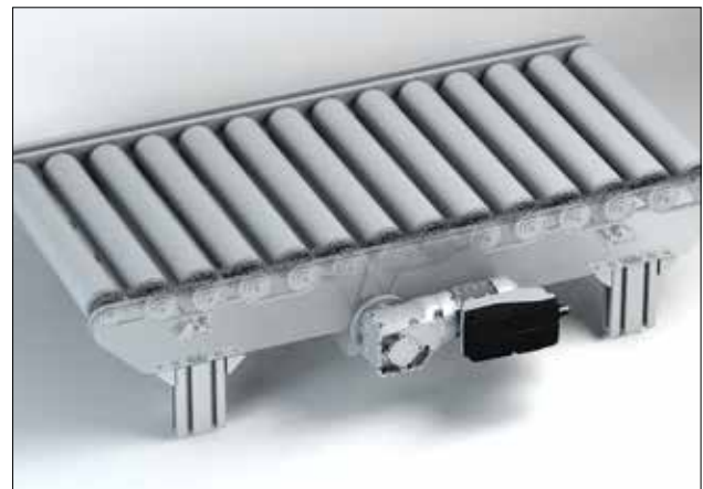
Example: Roller Conveyor Outline